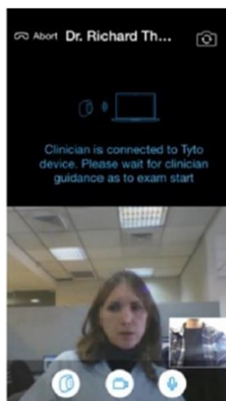
iPad display under remote control