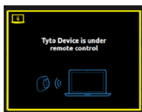
TytoCare device display when under remote control